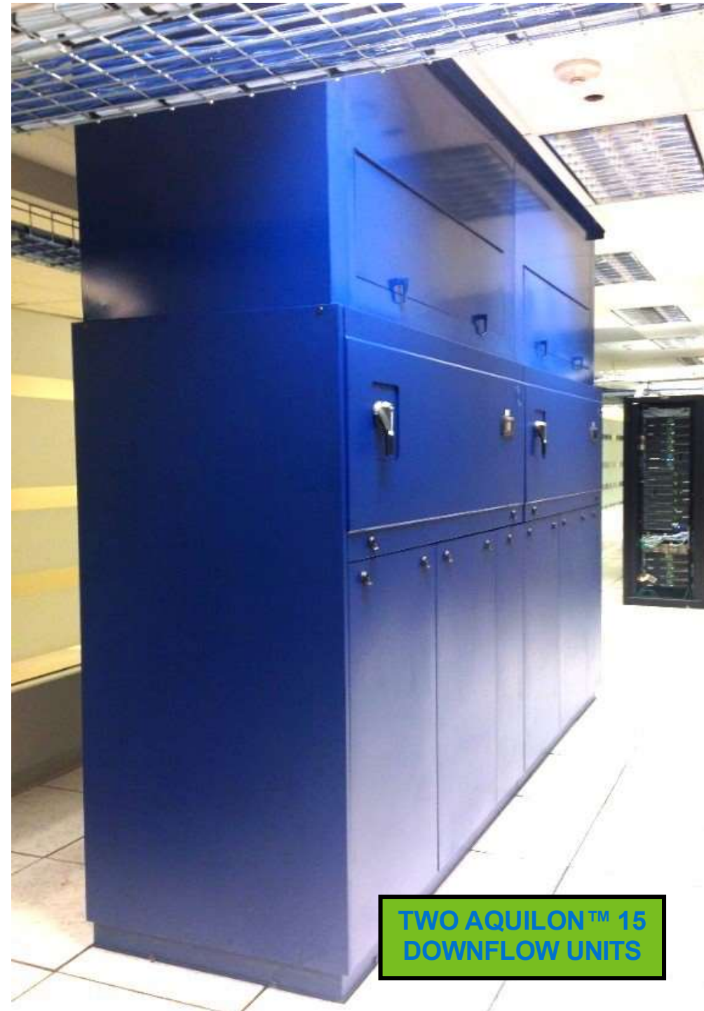
TWO AQUILON™ 15 DOWNFLOW UNITS